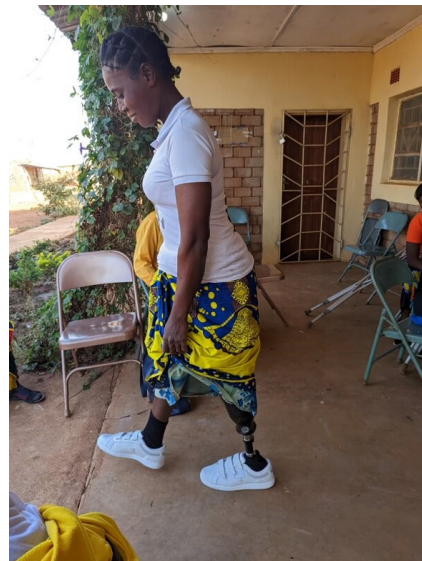
A new patient on the August 2022 trip trying out her new prosthesis