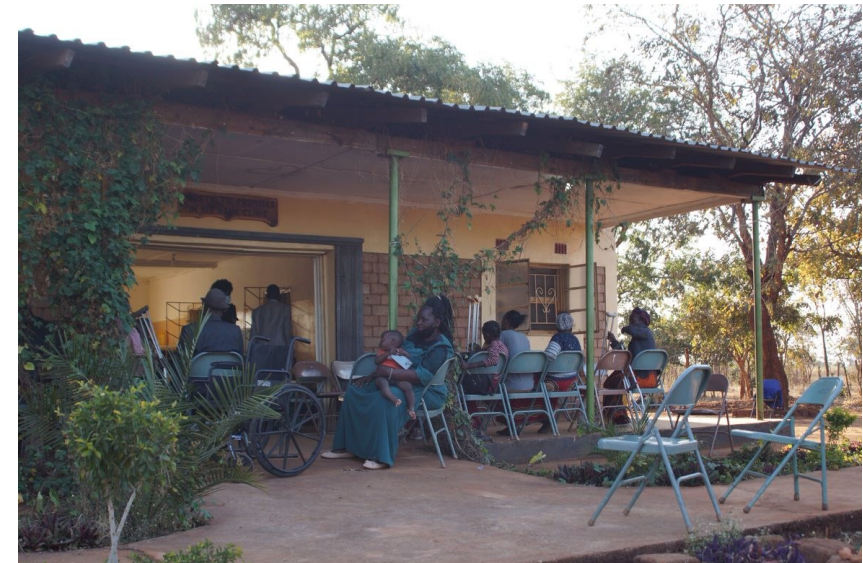
The PPIHN clinic during the August 2022 trip with our inspiring patients waiting their turn..